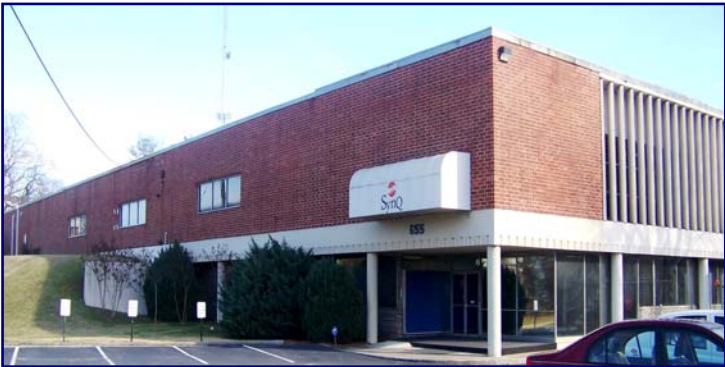
655 LAMBERT DRIVE ATLANTA, GA