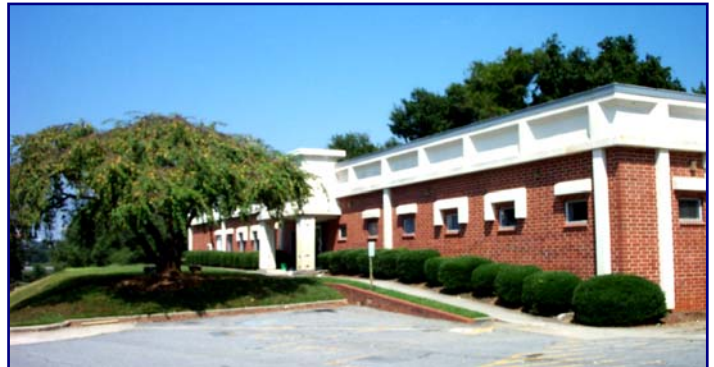
685 LAMBERT DRIVE ATLANTA, GA